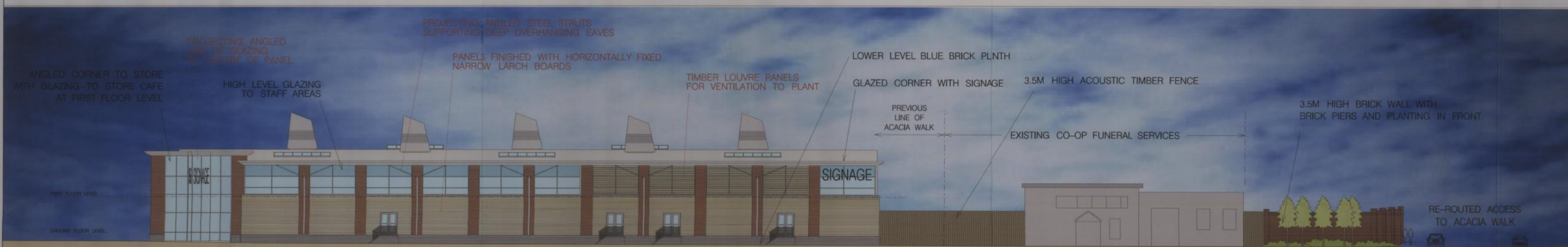
SOUTH ELEVATION TO MIDDLE STREET

Broxtowe Borough Council Planning & Community Development 07 JUN 2010