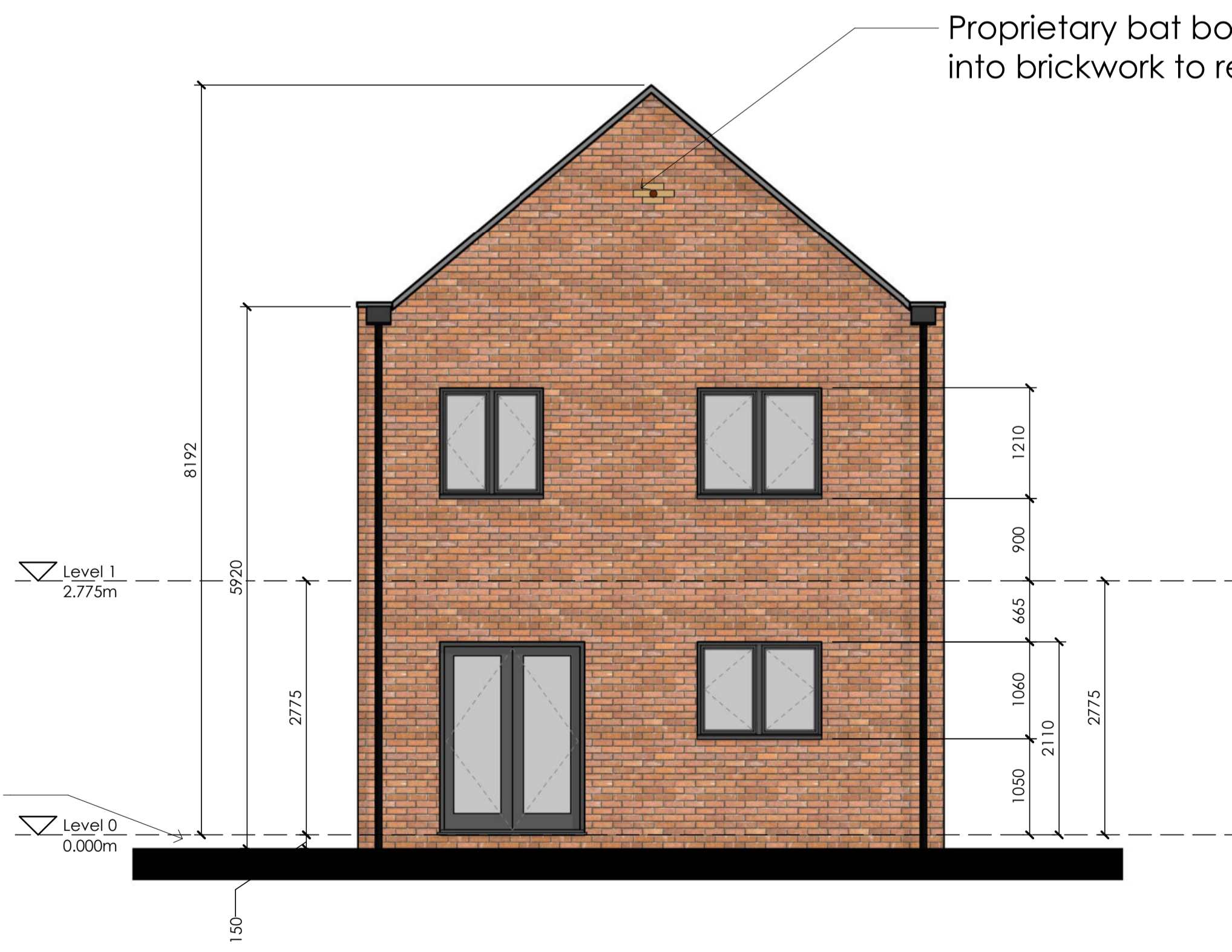
3 REAR ELEVATION - PROPOSED Scale 1 : 50

Proprietary bat box 'brick' built into brickwork to rear of property.