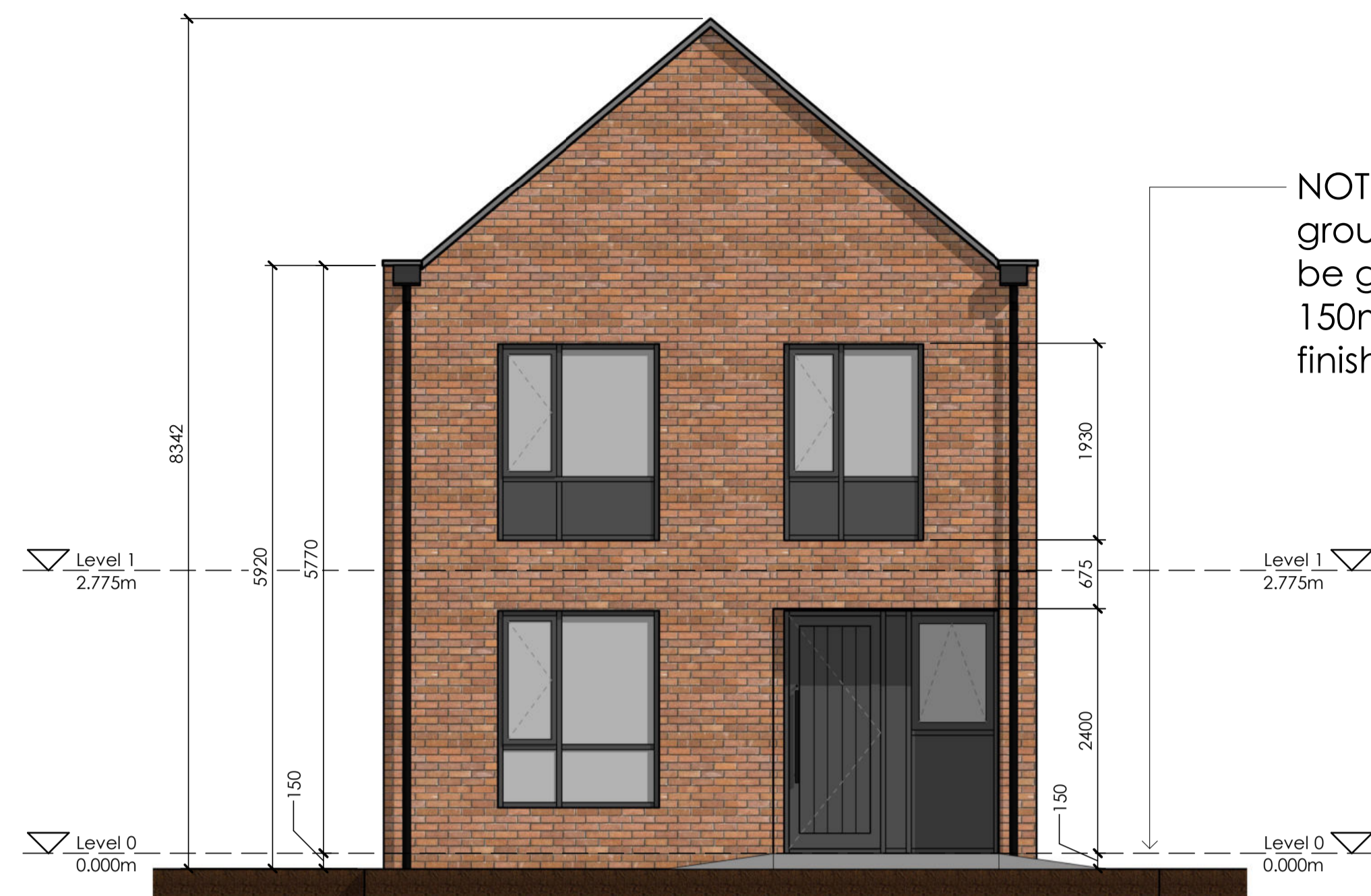
2 FRONT ELEVATION - PROPOSED Scale 1 : 50

NOTE: external ground level will be generally 150mm lower than finished floro level.