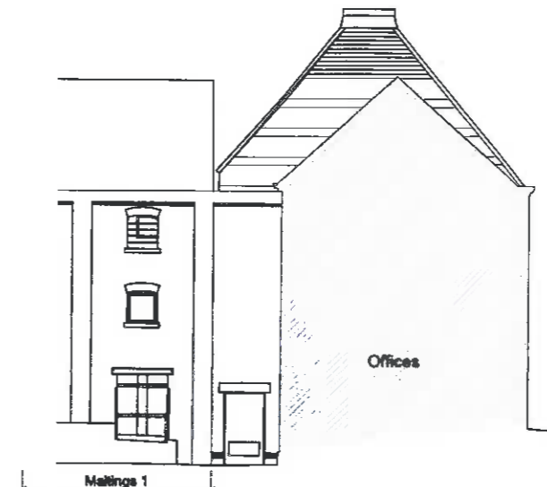
NORTH WEST (Office) SIDE ELEVATION