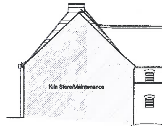
NORTH WEST (Kiln Store) SIDE ELEVATION